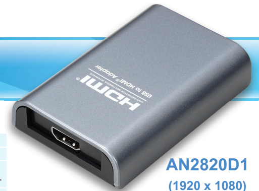
AN2820D1 (1920 x 1080)

* Specification is subject to change without further notice.